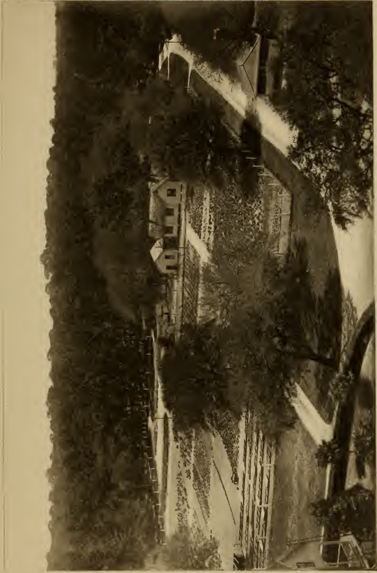
BIRDS EYE VIEW OF VEGETABLE GARDEN